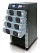
Scalable and Hot-swappable