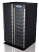
100-120 kVA + Battery Cabinet